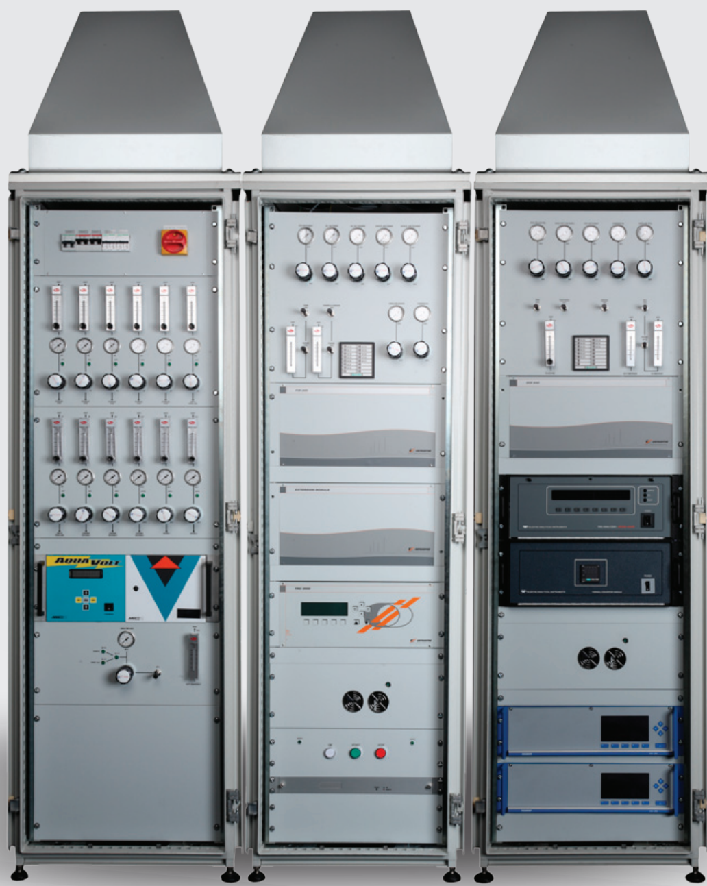
CO 2 for food and beverages application : Air Liquide Austria (2011)

On demand, we can also provide a complete solution for the measurement of N 2 for food applications